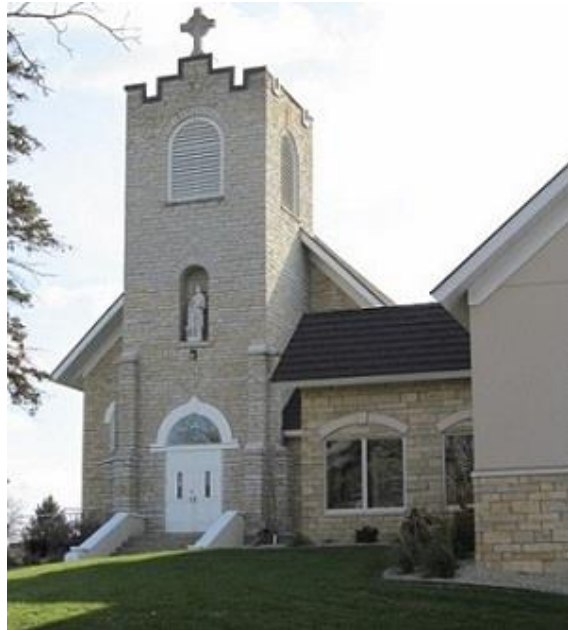
St. Bridget 2123 County Rd 16 SE Rochester, MN