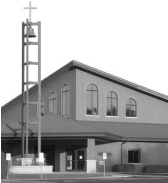
St. Bernard 116 4 th Ave SE Stewartville, MN