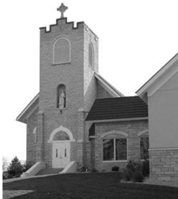
St. Bridget 2123 County Rd 16 SE Rochester, MN