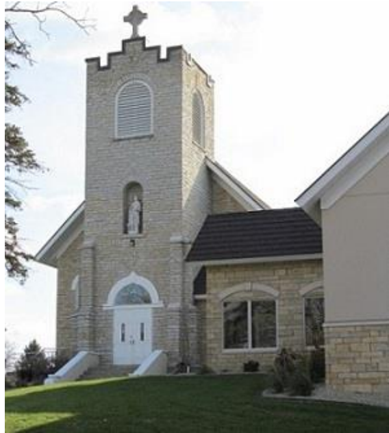
St. Bridget 2123 County Rd 16 SE Rochester, MN