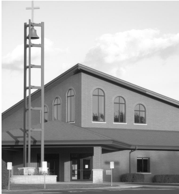
St. Bernard 116 4 th Ave SE Stewartville, MN